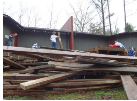
Wood used to create a two-tier farm garden. Volunteers from Pi Kappa Phi