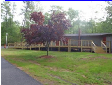
New Ramp and Porch