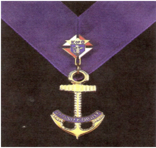
THE GRAND KNIGHT ---- The Anchor, indicative of Columbus, the Mariner. The anchor has also been a variant form of the Cross for centuries.